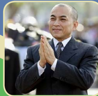
Norodom Sihamoni, King of Cambodia

The King of Cambodia is Norodom Sihamoni. He lives in a palace in Phnom Penh. Cambodia also has a national assembly and a council of ministers. The Prime Minister is Samdech Hun Sen. There are two political parties in the National Assembly, the Cambodian People's Party (C.P.P), led by Hun Sen, and the Cambodia National Rescue Party (CNRP), led by Sam Rainsy.