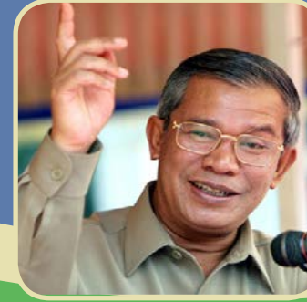
Samdech Hun Sen, Prime Minister