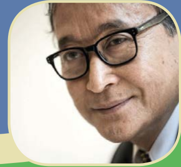
Sam Rainsy, Leader of Opposition

Phnom Penh is the capital city on the Mekong and Tonle Sap Rivers. Other towns in Cambodia are Battambang, Siem Reap, Kompong Cham, Sihanouk ville, and Kompong Chhnang and more.