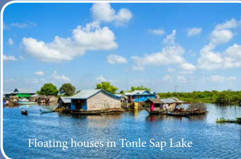
Floating houses in Tonle Sap Lake

Tonle Sap Lake and the Mekong River are among the geographical wonders.