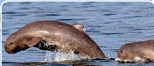
Dolphins in the Mekong River